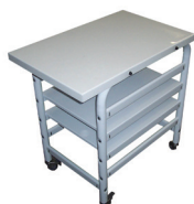
Table on wheels

Table on wheels (2 with brakes) (Height 800 mm x Length 760 mm x Depth 489 mm)