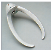
2-branch aluminium arm