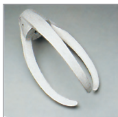
3-branch aluminium arm, recommended for pizza dough